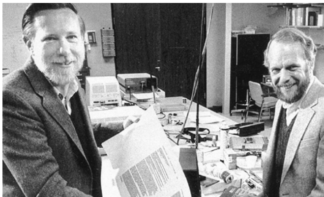
Adobe founders John Warnock and Chuck Geschke

The Portable Document Format (PDF) is the de facto standard for digital documents worldwide. No other technology comes close to PDF in marketplace acceptance.